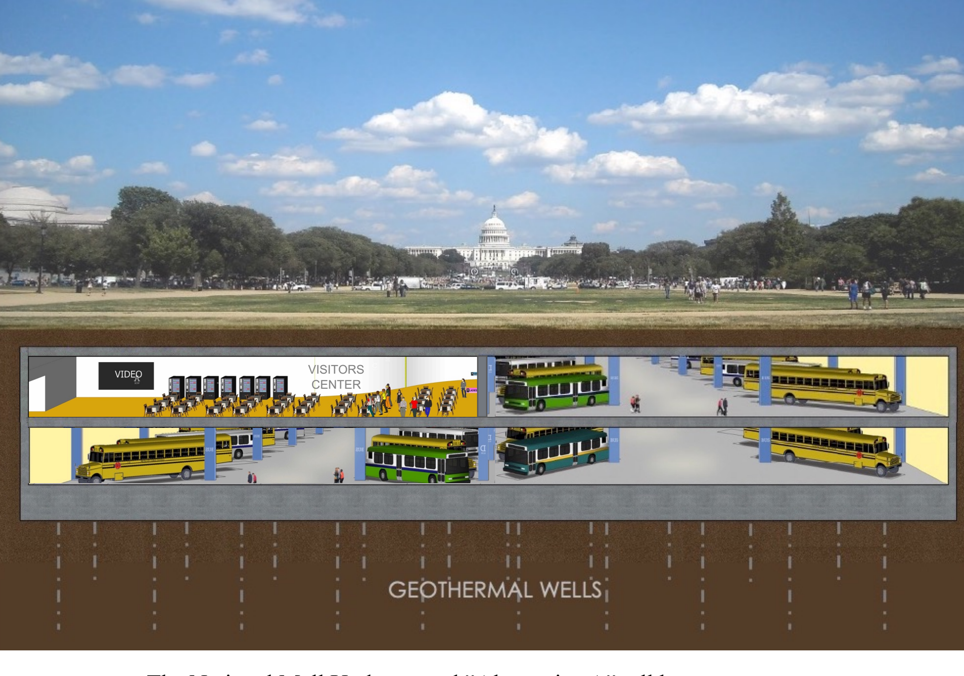
The National Mall Underground "Alternative A": all buses, no cars